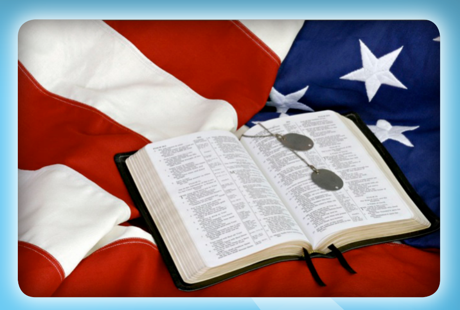
This July 4th, be sure to give thanks for all the men and women who have given everything that we may have freedom to worship God the Father and preach full salvation through His only begotten Son, Jesus.